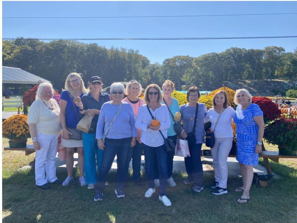
Dame Farm – October 3, 2023

Thank you to the group who ventured out to Dame Farm in Johnston, RI and to the Jack-O-Lantern Spectacular at the Roger Williams Zoo. A delicious meal was enjoyed at Twin Oaks restaurant in Cranston, RI. It was a beautiful day, and we hope that it put you in the mood to enjoy Fall.