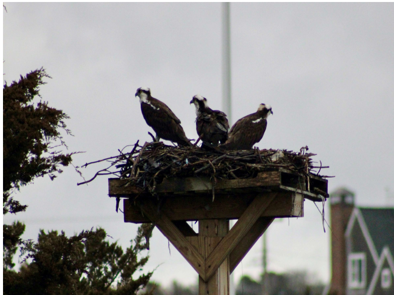
Parents with a returning offspring visiting the nest, April 2023