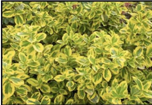
Euonymus fortunei 'Gold Splash' golden euonymous

Here are two examples of specimens and how index cards would be labeled.