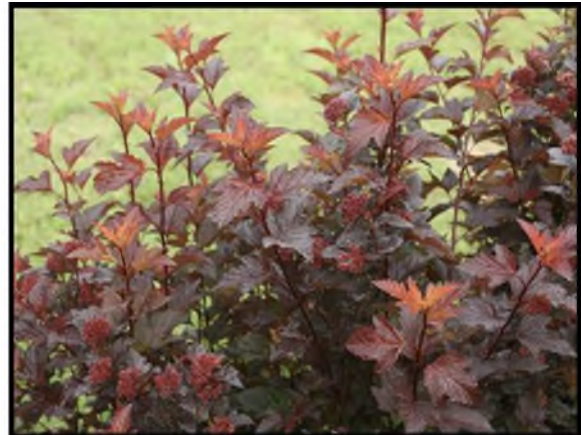
Physocarpus opulifolius 'Ginger Wine' ninebark